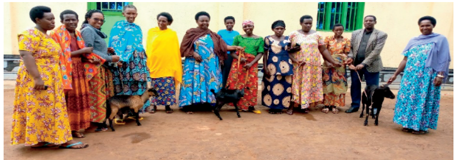
Those widows should raise goats and produce for helping to their family development and give others to raise.