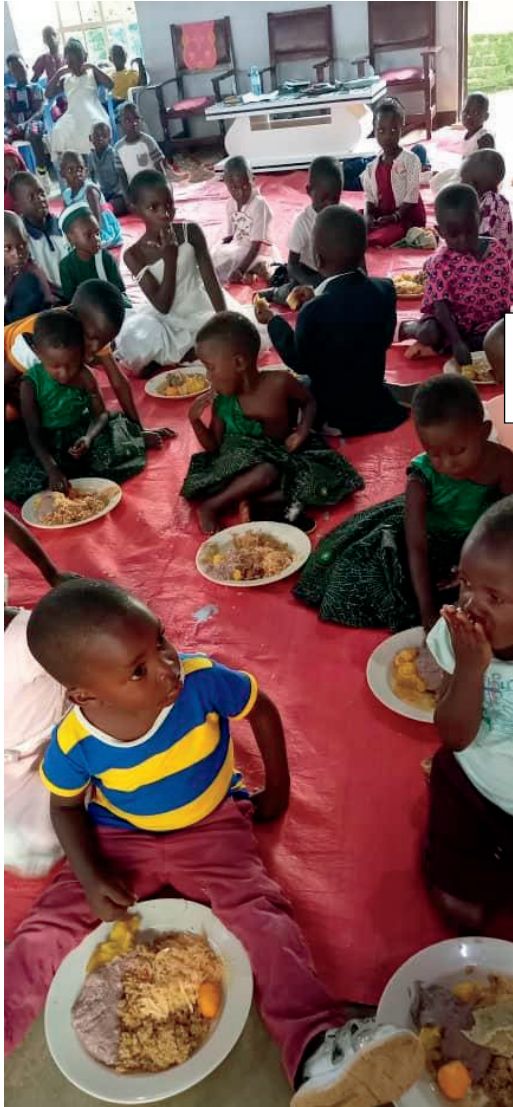
Christmas is the most exciting time of the year for children. Children at Kiwangala Miracle Center Church had a Christmas meal to celebrate the season.

PLOT 135 KATWE SSEBA BUILDING. P.O. BOX 4428 KAMPALA