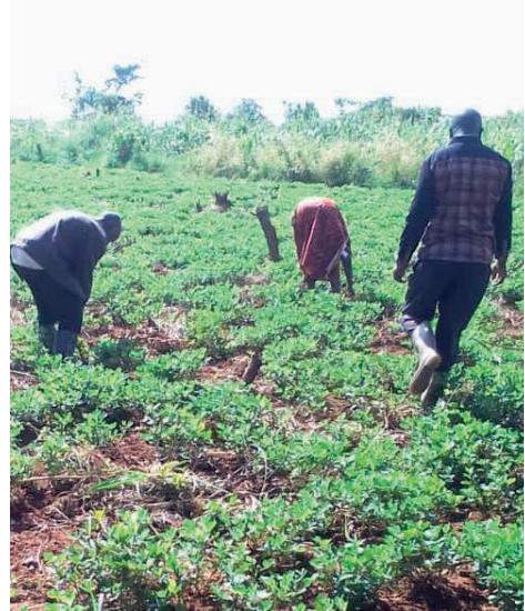
In 2023 Karamoja Good Samaritan Center the team started growing groundnuts as a way to fight hunger in the region.