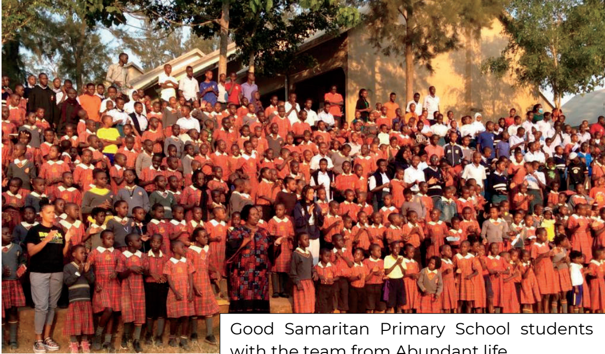
Good Samaritan Primary School students with the team from Abundant life.

PLOT 135 KATWE SSEBA BUILDING. P.O. BOX 4428 KAMPALA