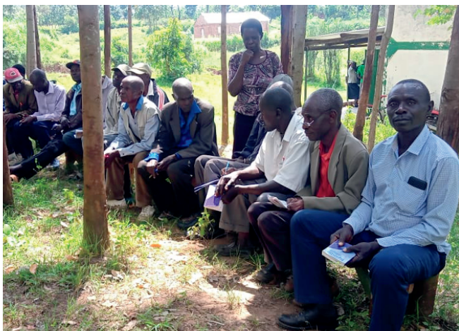
Addictions Recovery Group at Namwela Center