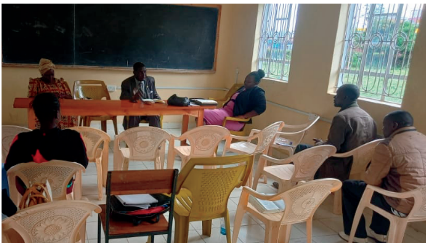
level 2 Counseling in Migori GSM Center