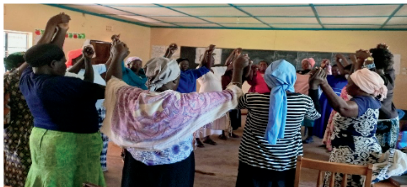
widows meet at the GSM hall