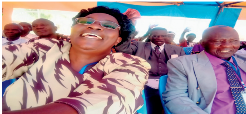
A section of GSM Leaders during the 37th year's celebration at GSM Uranga