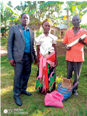
This photos shows Good Samaritan Center Coordinator with people