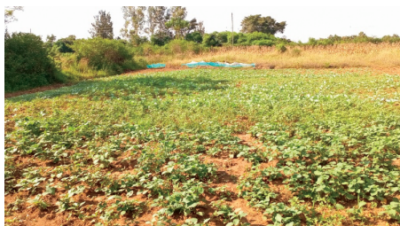
vegetables at the GSM project