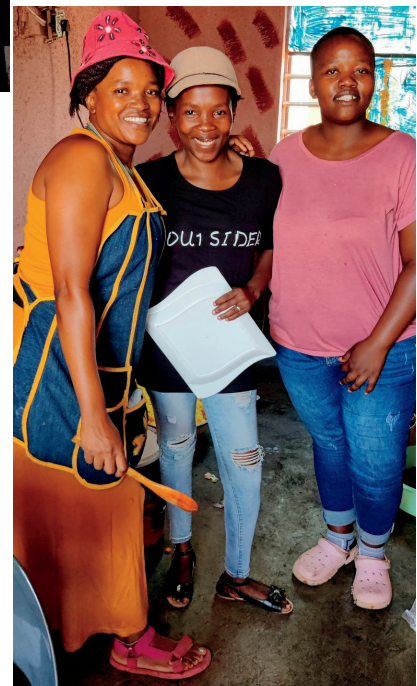
These three lovely ladies did magic in the kitchen. Look at the delicious food they served us! Thank you so much GSM Soshanguve! The Lord bless you and keep 🙏