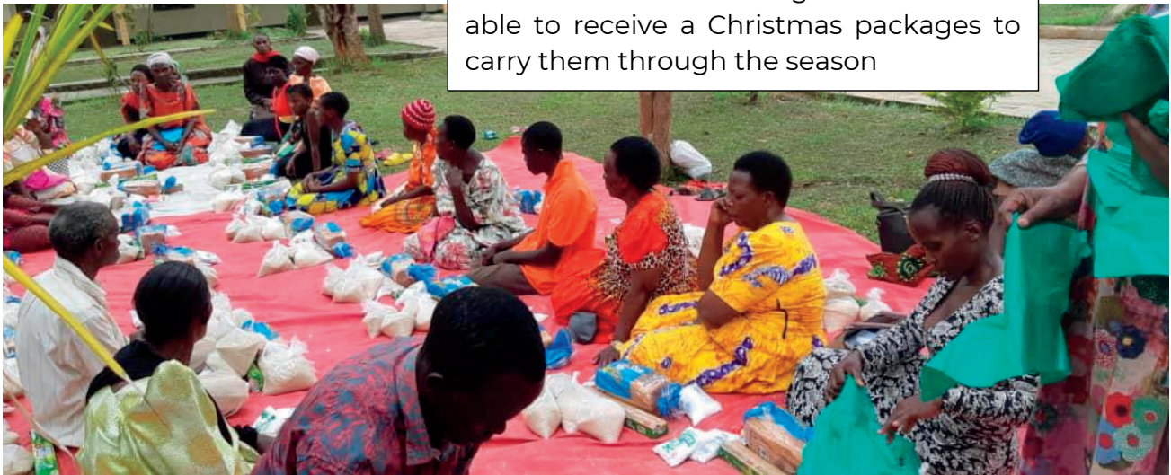
Senior citizens in Kiwangala center were able to receive a Christmas packages to carry them through the season

PLOT 135 KATWE SSEBA BUILDING. P.O. BOX 4428 KAMPALA