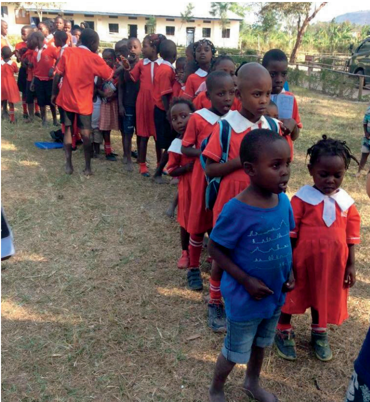
Nambirizi Good Samaritan School children at parade