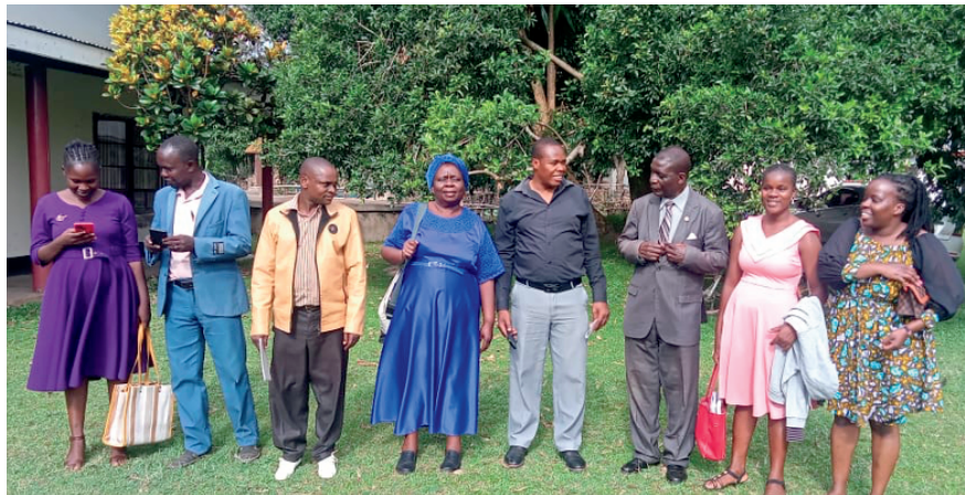
Level 2 Counselor Trainees in Migori Center