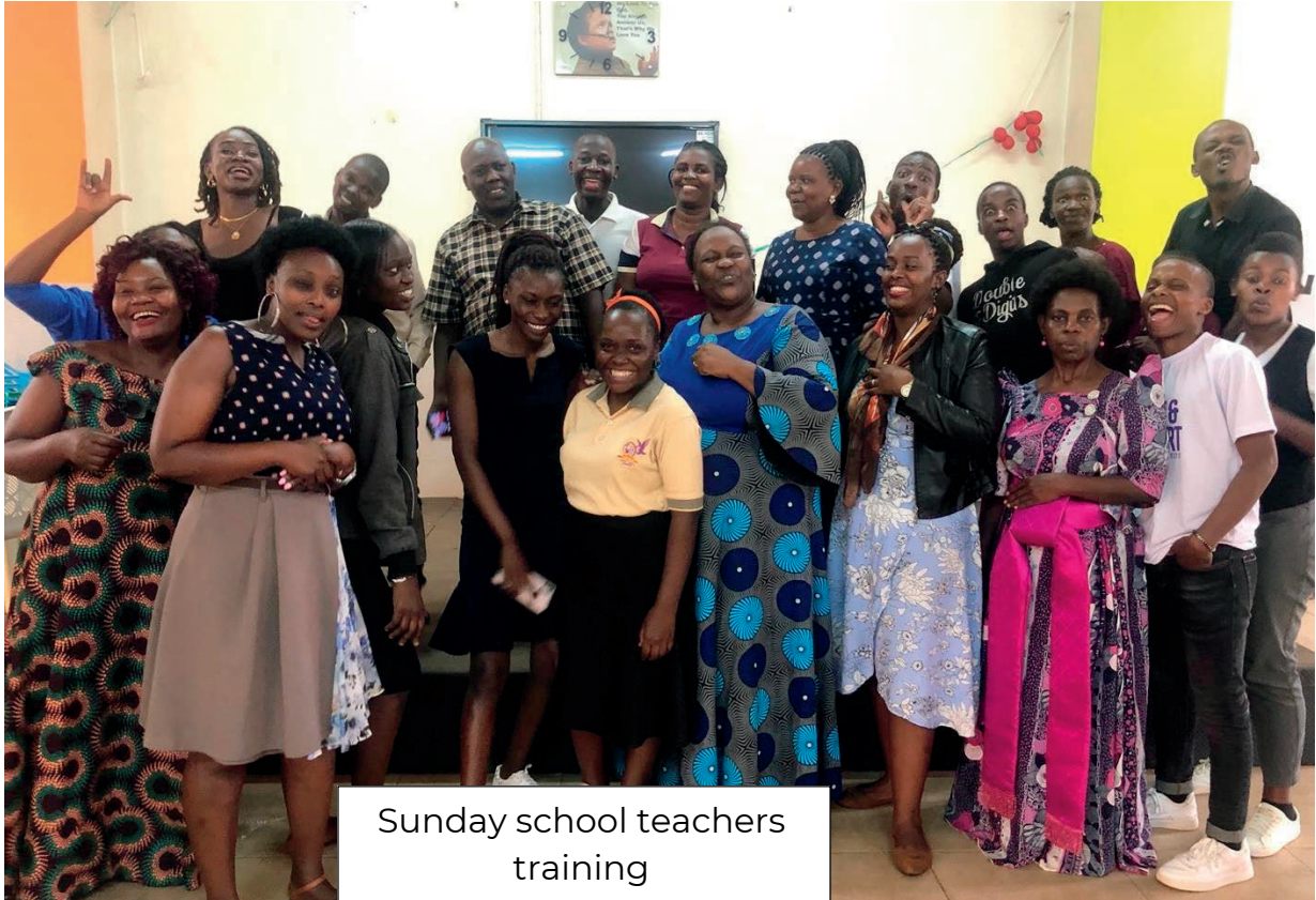
Sunday school teachers training

PLOT 135 KATWE SSEBA BUILDING. P.O. BOX 4428 KAMPALA