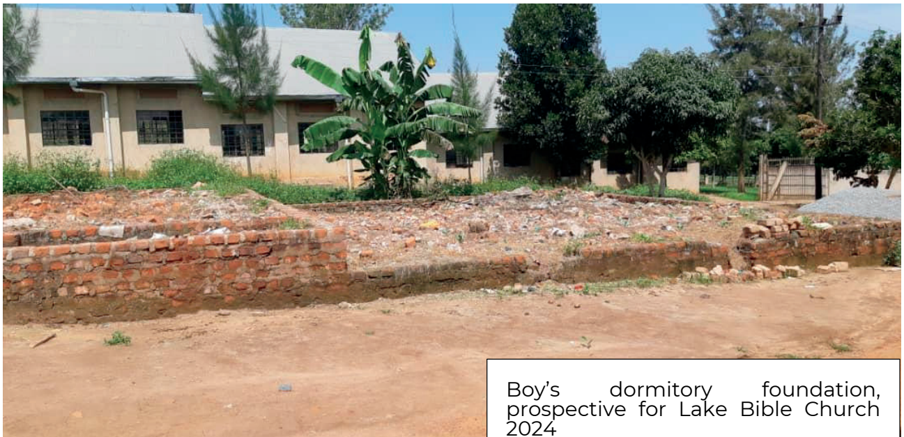
Boy's dormitory foundation, prospective for Lake Bible Church 2024