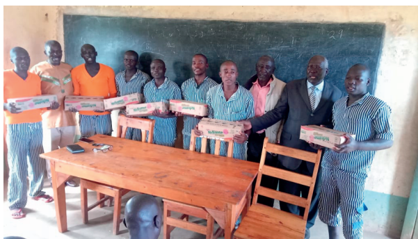
Addictions Recovery Group at Namwela Center

Recovery drug addict who dropped out of university and visited GSM center for counseling.