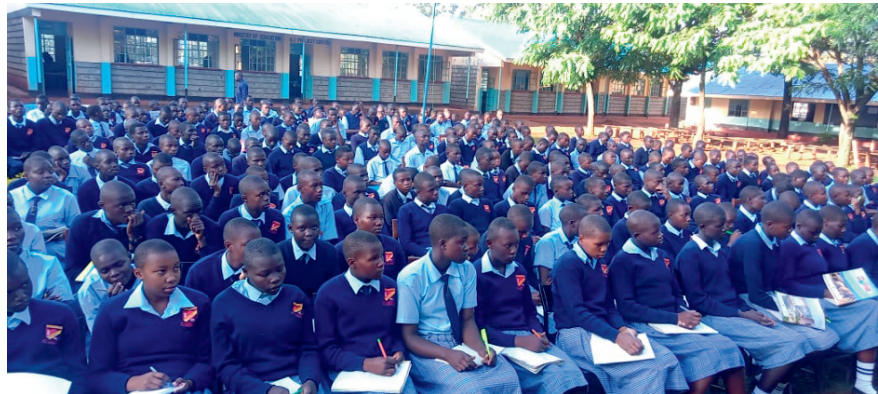
offering counseling and training to one of our schools in Kenya