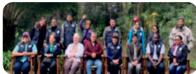
GSM IS IN GOOD HANDS

Our hosts arranged for us to visit historical sites in Tana and the countryside of their magnificent island. We experienced the beauty of Madagascar and got to see giant crocodiles and the beautiful and mysterious Lemurs that are native to Madagascar.