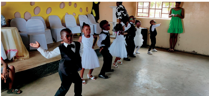
The graduates looked splendid in their beautiful garments, all dressed up in black and white!