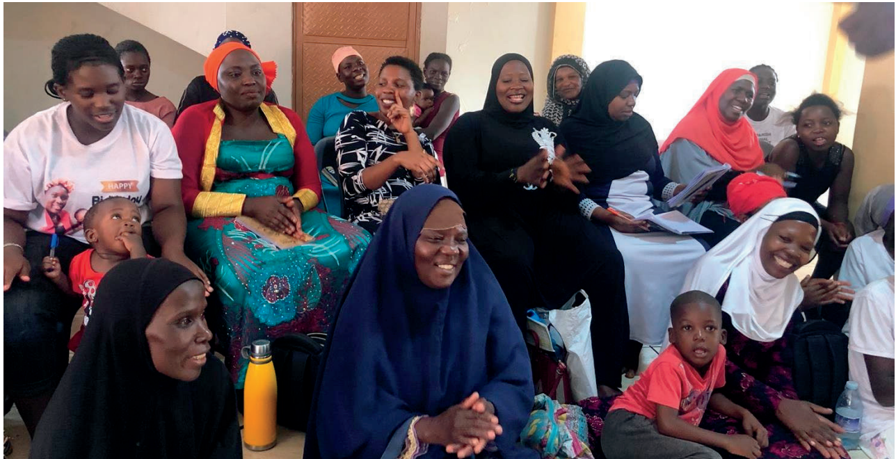
God`s Will womens group that meets at our head office every Thursday to share stories, make reusable pads and spend time together.

PLOT 135 KATWE SSEBA BUILDING. P.O. BOX 4428 KAMPALA