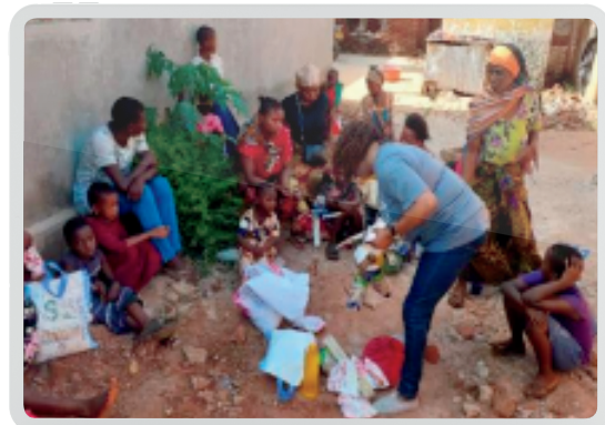
GSM IT staff distributing gifts to widows and orphans in Tungi village in Morogoro