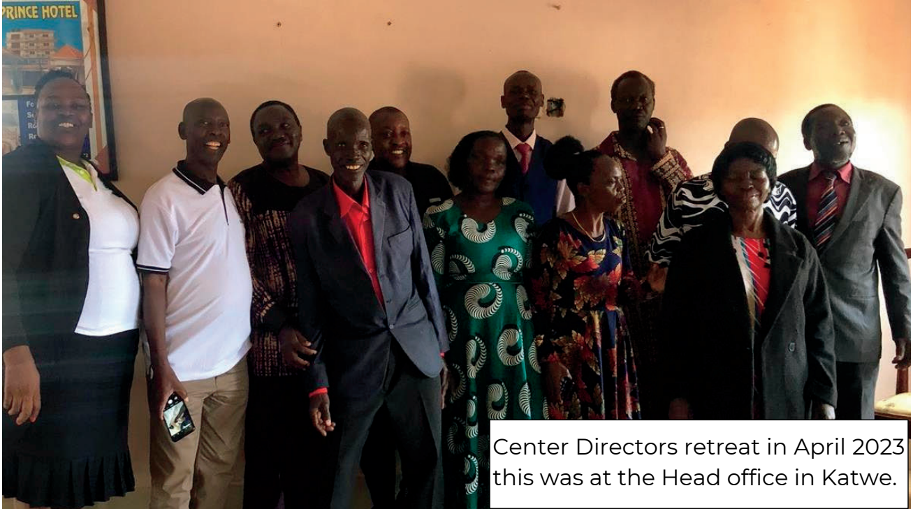
Center Directors retreat in April 2023 this was at the Head office in Katwe.

PLOT 135 KATWE SSEBA BUILDING. P.O. BOX 4428 KAMPALA