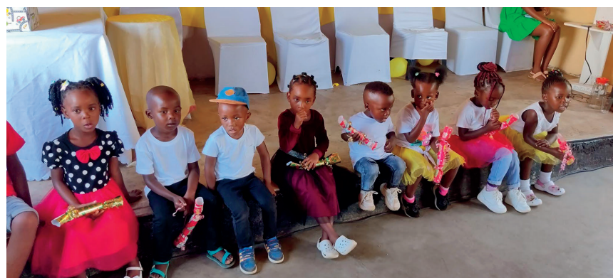
Graduate Walk Out for eight happy students! Students opened their Christmas Crackers filled with candy