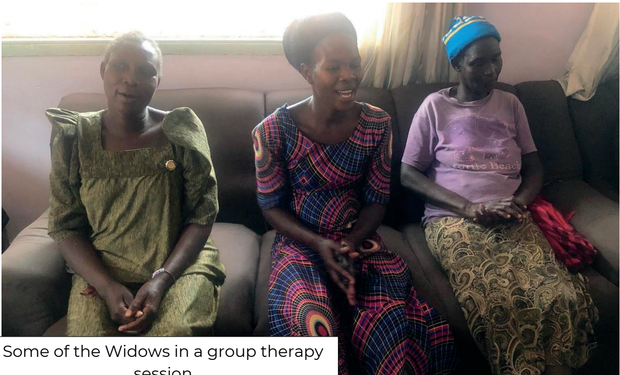
Some of the Widows in a group therapy session