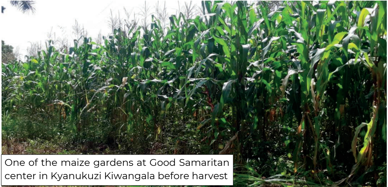
One of the maize gardens at Good Samaritan center in Kyanukuzi Kiwangala before harvest

PLOT 135 KATWE SSEBA BUILDING. P.O. BOX 4428 KAMPALA