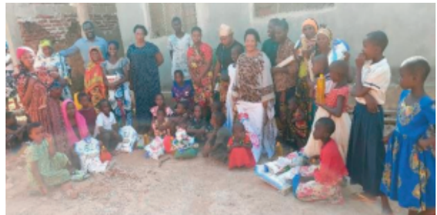
Twenty-one families paused for a group photo after they received different provisions (flour, rice, cooking oil, sugar, and soap) from the Goodwill Samaritan Ministries International in Tanzania.