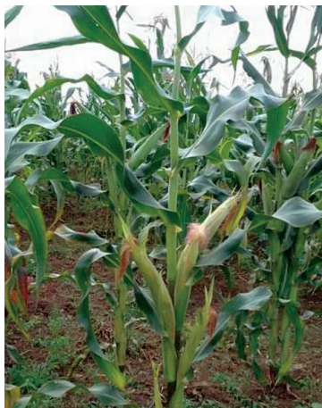
Maize at our farm in Uranga GSM Agricultural project