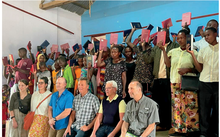
The team from Lake Bible Church with new converts at Kiwangala after they had received Bibles