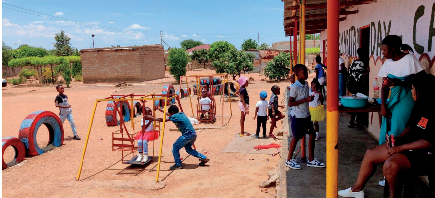
Students and families enjoyed the playground while we waited for the graduates to change from cap and gown into finery.