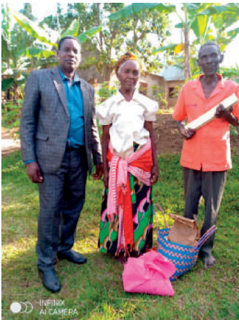
This photos shows Good Samaritan Center Coordinator with people