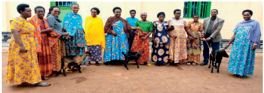
Those widows should raise goats and produce for helping to their family development and give others to raise.