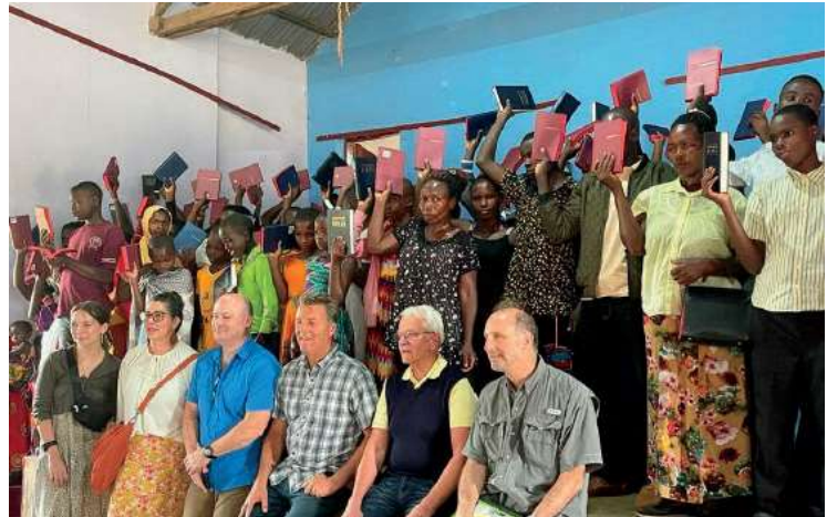
The team from Lake Bible Church with new converts at Kiwangala after they had received Bibles