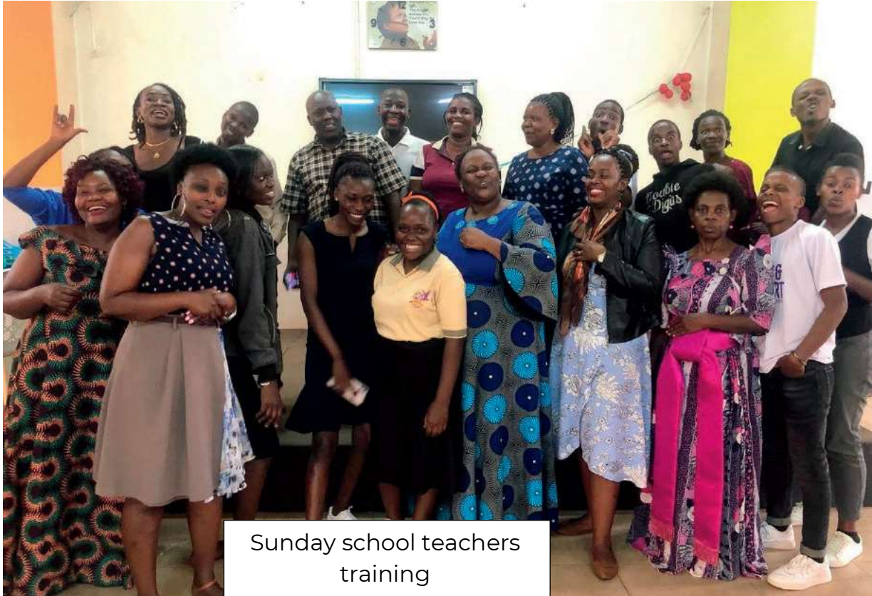
Sunday school teachers training

PLOT 135 KATWE SSEBA BUILDING. P.O. BOX 4428 KAMPALA