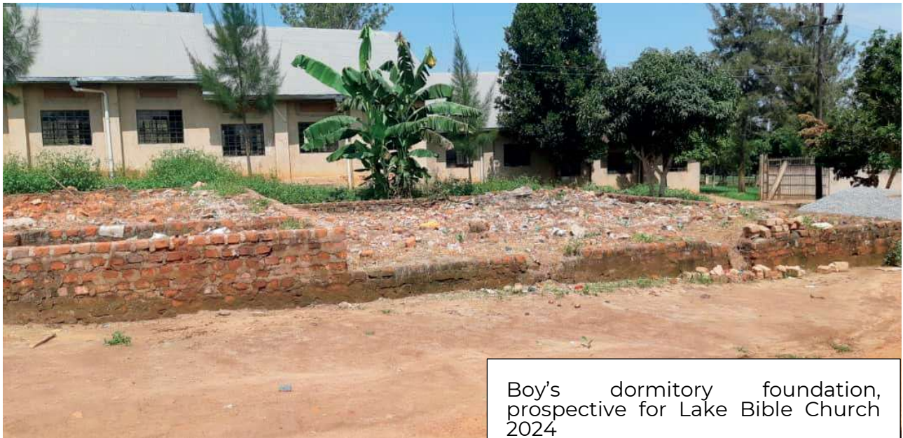
Boy's dormitory foundation, prospective for Lake Bible Church 2024