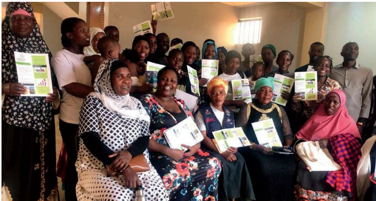
With support from Latek Stay Alliance in partnership with GSM we trained people in income generating skills. Soap making, reusable pad making and information on nutrition for slum families.