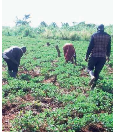
In 2023 Karamoja Good Samaritan Center the team started growing groundnuts as a way to fight hunger in the region.