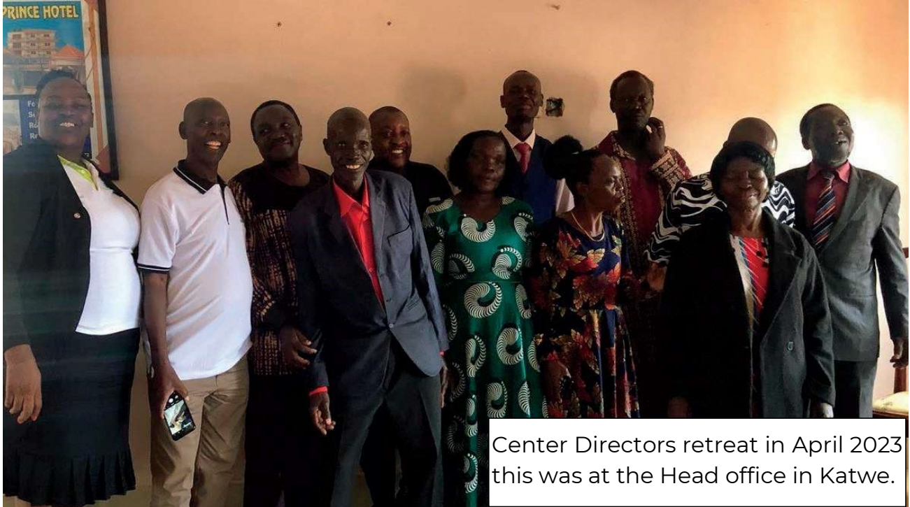
Center Directors retreat in April 2023 this was at the Head office in Katwe.

PLOT 135 KATWE SSEBA BUILDING. P.O. BOX 4428 KAMPALA