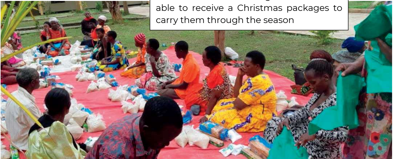
Senior citizens in Kiwangala center were able to receive a Christmas packages to carry them through the season

PLOT 135 KATWE SSEBA BUILDING. P.O. BOX 4428 KAMPALA