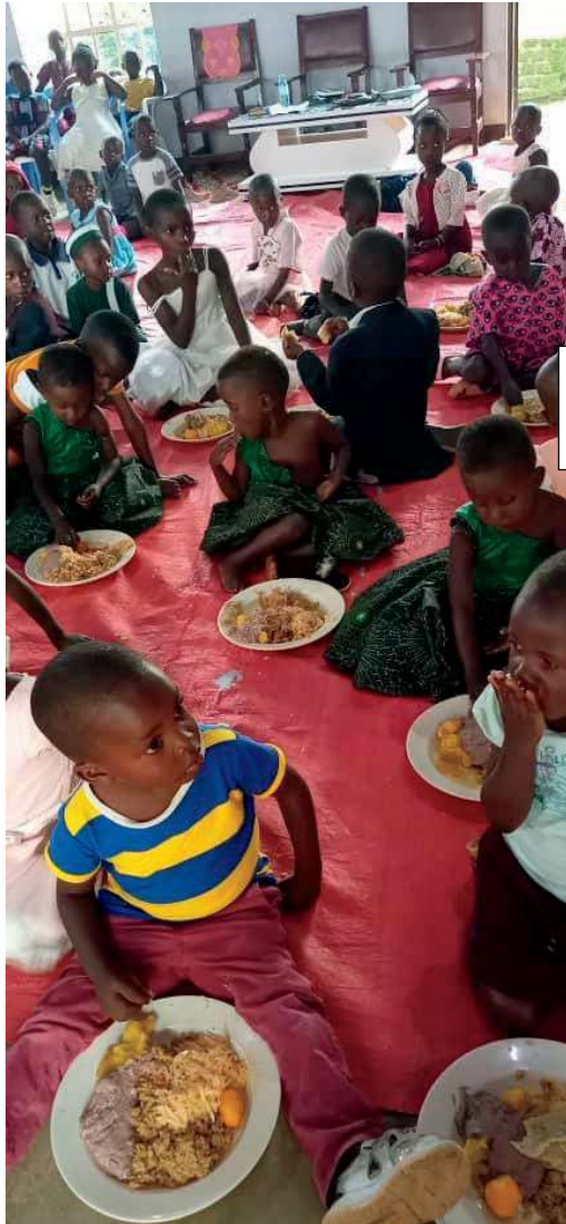
Christmas is the most exciting time of the year for children. Children at Kiwangala Miracle Center Church had a Christmas meal to celebrate the season.

PLOT 135 KATWE SSEBA BUILDING. P.O. BOX 4428 KAMPALA