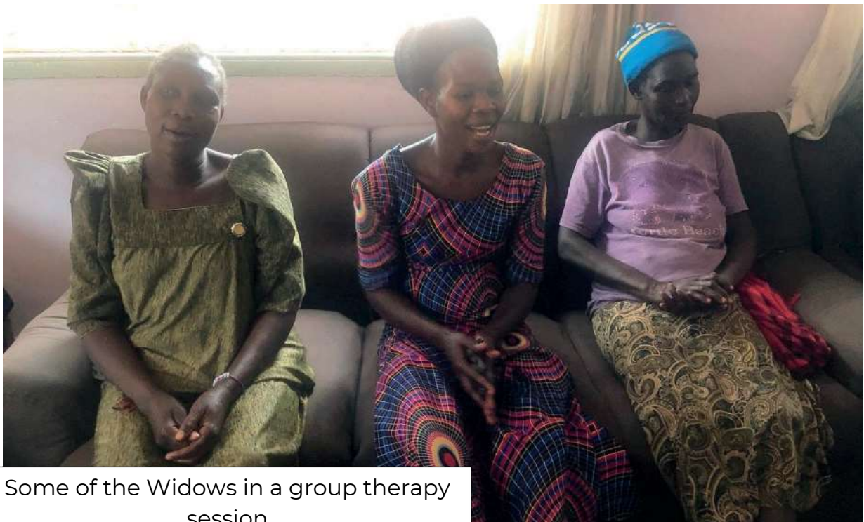
Some of the Widows in a group therapy session