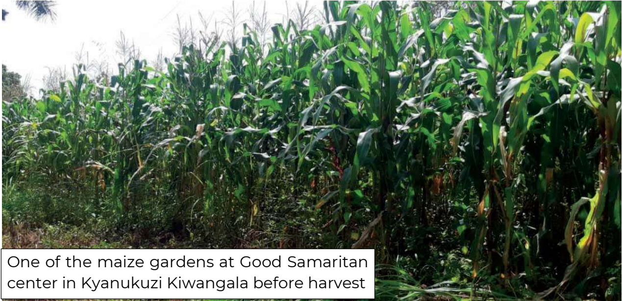
One of the maize gardens at Good Samaritan center in Kyanukuzi Kiwangala before harvest

PLOT 135 KATWE SSEBA BUILDING. P.O. BOX 4428 KAMPALA