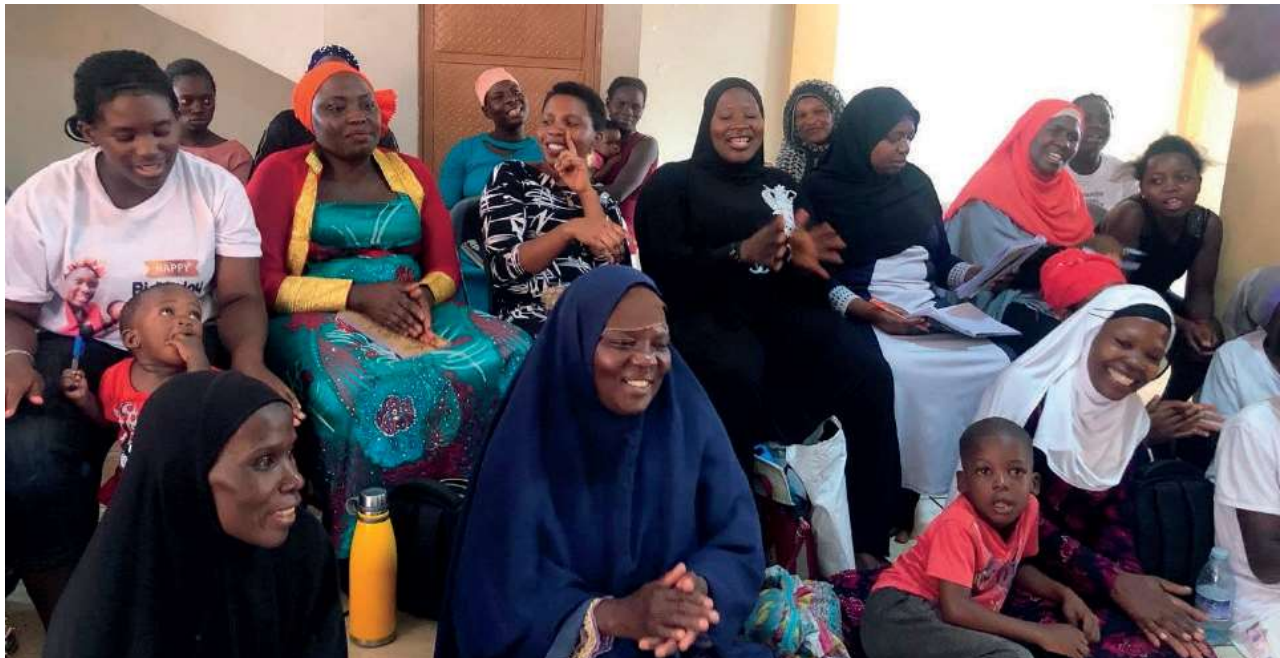
God`s Will womens group that meets at our head office every Thursday to share stories, make reusable pads and spend time together.

PLOT 135 KATWE SSEBA BUILDING. P.O. BOX 4428 KAMPALA