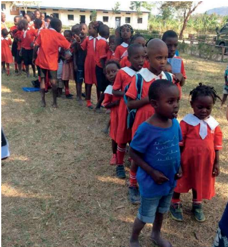
Nambirizi Good Samaritan School children at parade